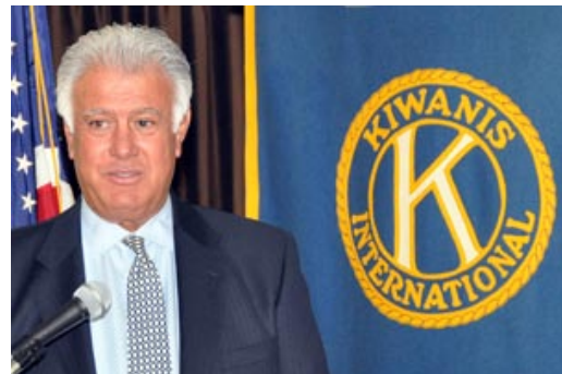
Mayor Ted Gatsas - March 10